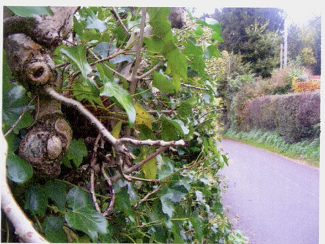
View from boundary along Folly Lane towards narrowing road.