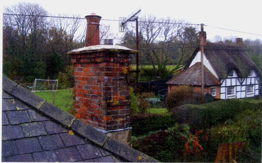
View from Yew Tree Cottage showing how the chimney top is lower than the eaves of no 7.

Shows how listed cottages 5 and 6 (opposite) and cottage 7 to the right dominate the area. The structure to the right is the prefabricated building subject of the demolition request.